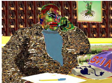
Dimitar Shopov Selfie, 2016 digital drawing Print on paper 39 x 47 cm unique work