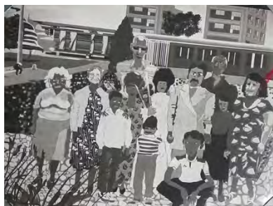
Dimitar Shopov In Kussadasi, 2015 photograma 11,5 x 19,5 cm unique work