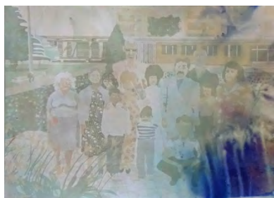
Dimitar Shopov Pamporovo, 2015 photograma 20 x 29 cm unique work