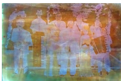
Dimitar Shopov Wild West, 1986 feltmaster on paper 20 x 29 cm unique work