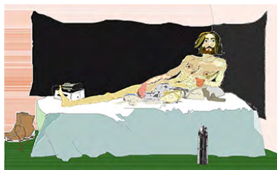
Dimitar Shopov Dedo, 2016 digital drawing Print on paper 13 x 20 cm unique work